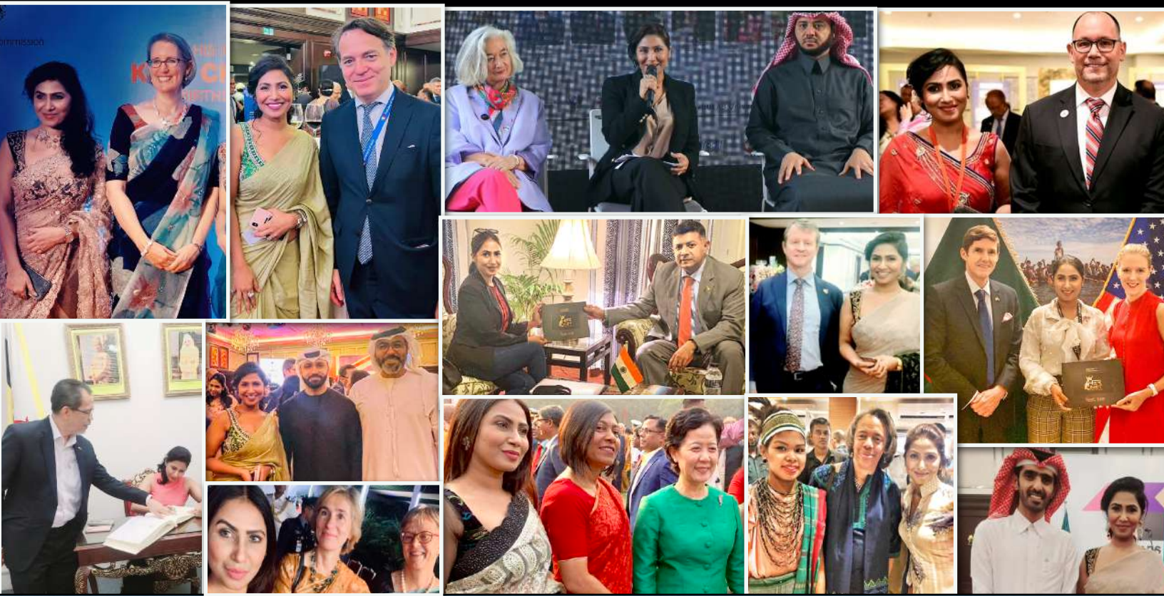
National day of UK, Itav. French. Saudi Arabia. USA.Brunei. Dubai. EU. India. Norway. Indoneia. Thailand. usa. Oatar. Emirates.