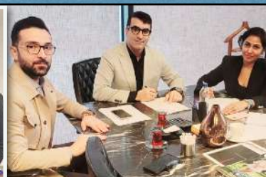
NFT Conf at Maxity, UK: Chinese investors, organisers & Ukraine refugee singer | Meeting Turkey Hashim Group