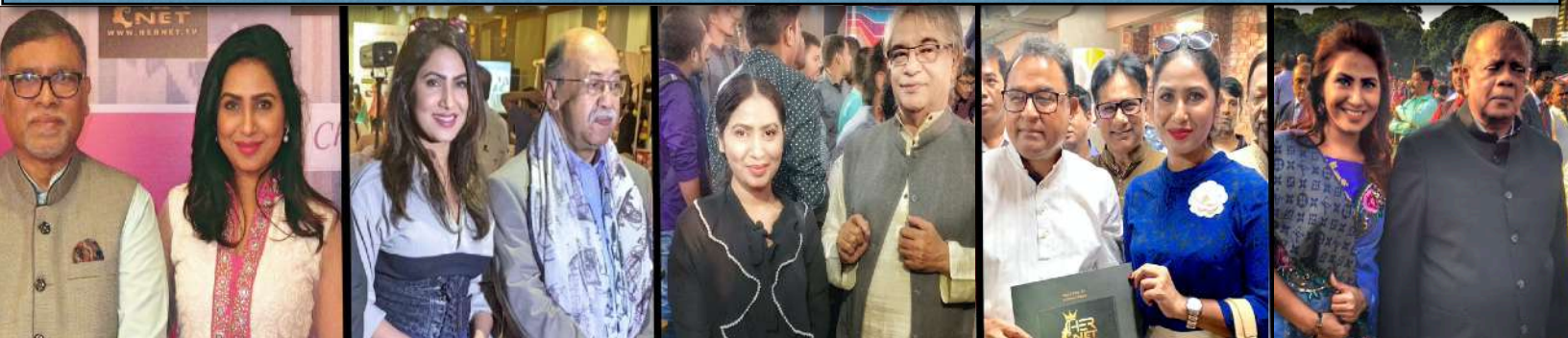
With Minister of Health, Industry, tele communication, planning, cabinet member of Bangladesh