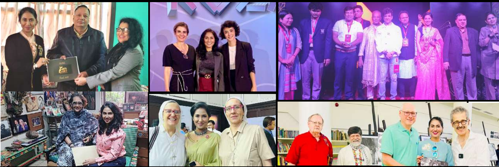
With Education Minister of Nepal, At Turkey Women Fashion show Gala, At Ted Talk stage with speakers, (Bellow) International Fashion Designer BIBI Russel, NUN from UK Mission, Delegate meeting with the president at Pristina