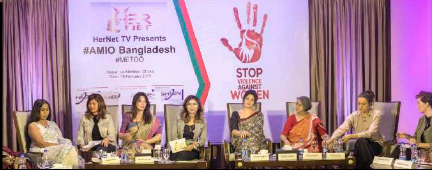
HerNet Women's day talk with journalists b) Dialogue with local & international personalities on 'Me TOO'