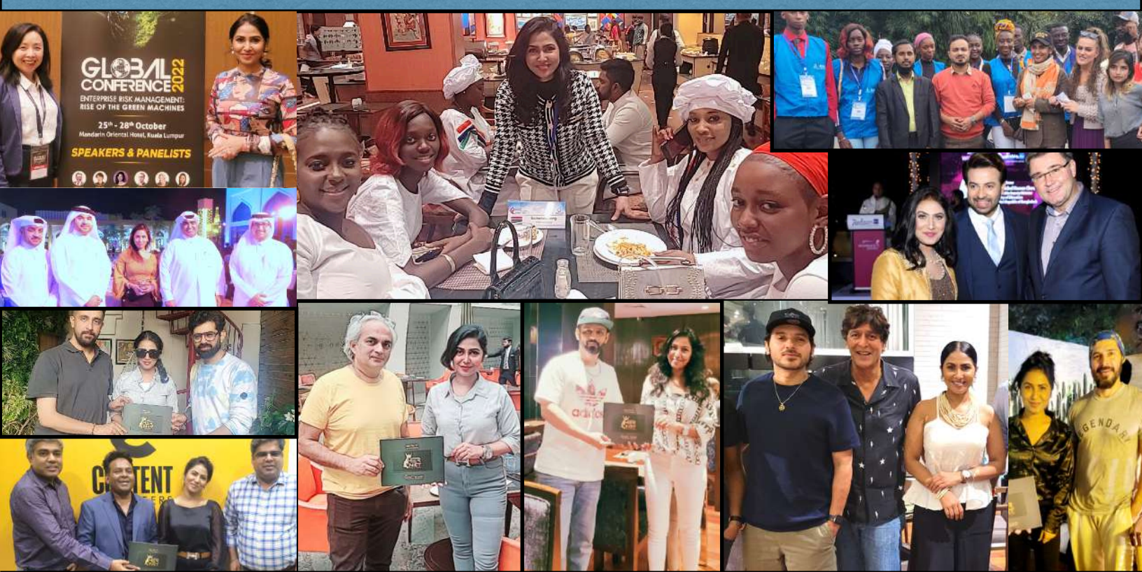
China Leaders Global Conference, Dialogue with African Women, Thailand Leadership Summit, Middle East Summit, Nepal Global Dialogue, Bangladeshi no 1 actor, Bollywood directors ,producers, Singers & Notable actors.