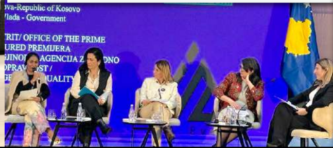
With the Honourable Mayor of Kosovo & President of the Chamber of Commerce & International Dialogue on the right of people with Disability