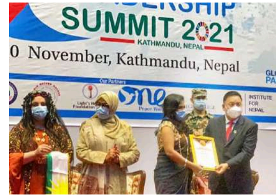
1st Bangladeshi female at International TEDx |