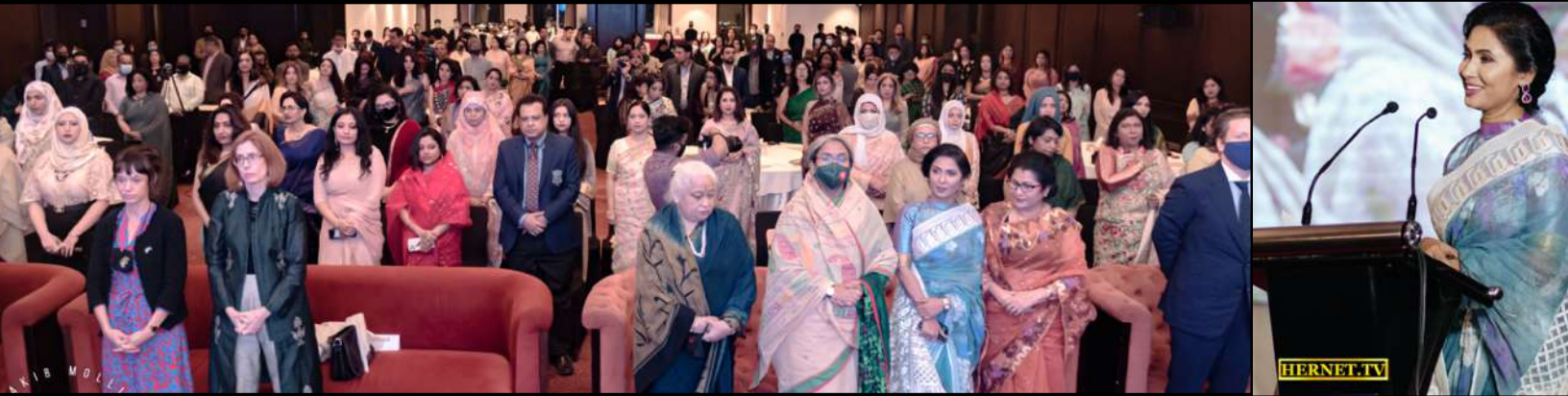
"Bongokonnar Tantprem" Docufilm Launch by HerNet featuring 75 Leading women & 8 Foreign Mission head