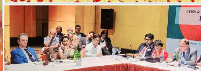
As speakers in various National Dialogue of FBCCI, BUET university, Embassy Dialogue etc