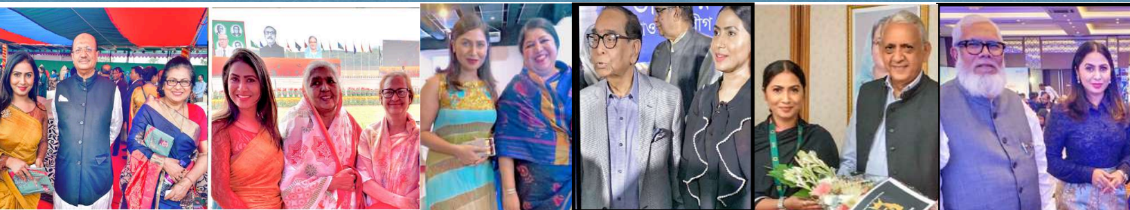
Former Minister of, Public works & Women affairs | With the Speaker & 3 Advisors to Prime Minister of Bangladesh