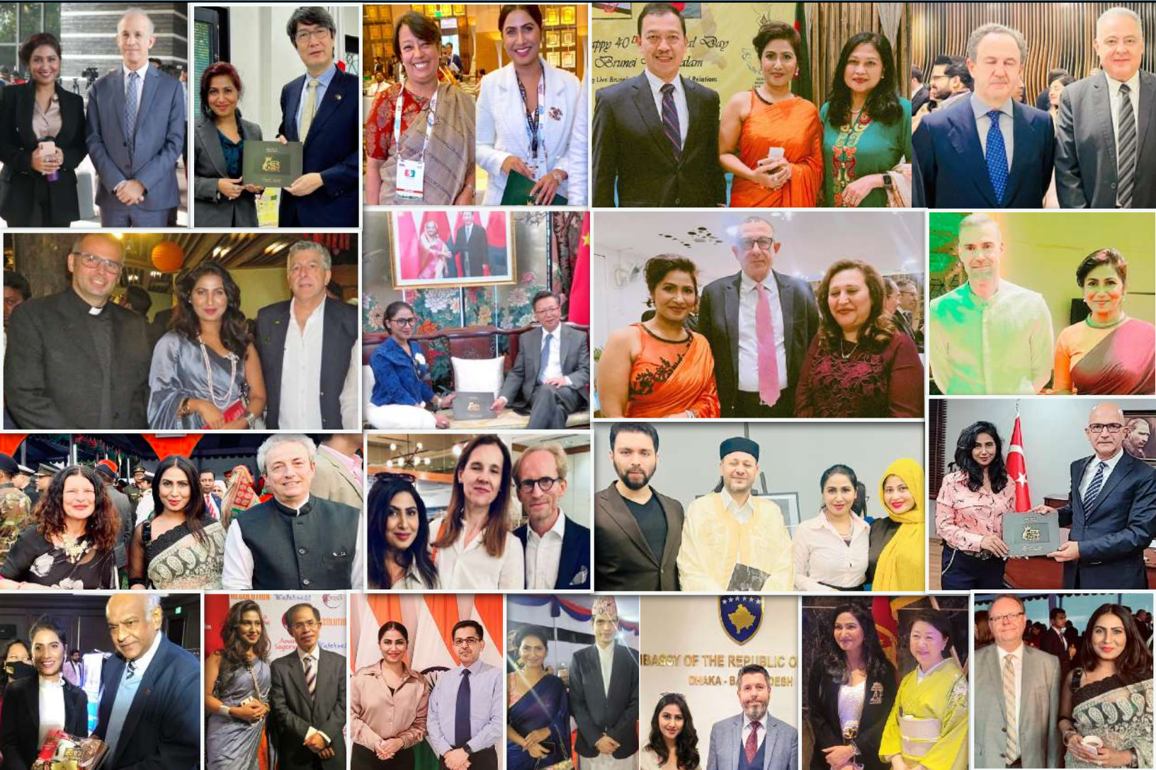
Mission head of Unicef, Japan, India, Indonesia, Spain, Egypt, Canada,Vatican City, Brazil, China, Palestine, EU, EU, Netharland, Libya, Turkey, Srilanka, Vietnam, India, Nepal, Kosovo, Japan,