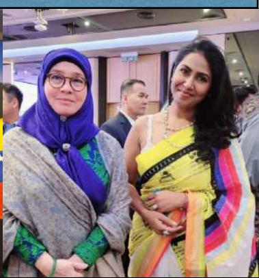
Global Leaders meet at the President's House at Pristina | Thailand Leadership Summit | With the Queen of Malaysia