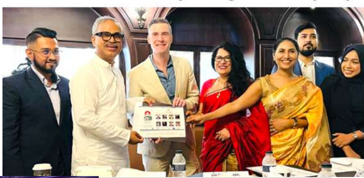
"Ethical Purchasing in the RMG sector" HerNet Foundation's multi-Party dialogue on "May Day"