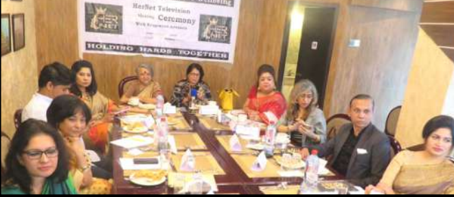
Bangladeshi 1st 3rd Gender talent reality Show on HerNet. HerNet Board of Advisors Meet.