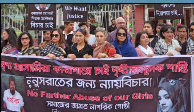
Justice for Nusrat by HerNet Foundation against Rape in 2019, Global media Coverage.