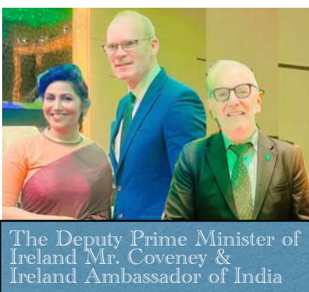
The Deputy Prime Minister of Ireland Mr. Coveney & Ireland Ambassador of India

Launch Employment Opportunity Accelerator to promote gender equity & financial empowerment.