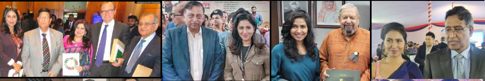
With The Uk Ambassador, Minister Of Foreign, Home, Labour, Agriculture, Ict, Post, Information, Culture