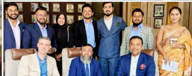
At Secretariat for a dialogue on agriculture & Women's role, Support for Blind, tribute to Father of the Nation with IPTV association, Local Fashion, Recognition for drugs awareness role as youth, Garments Talk.