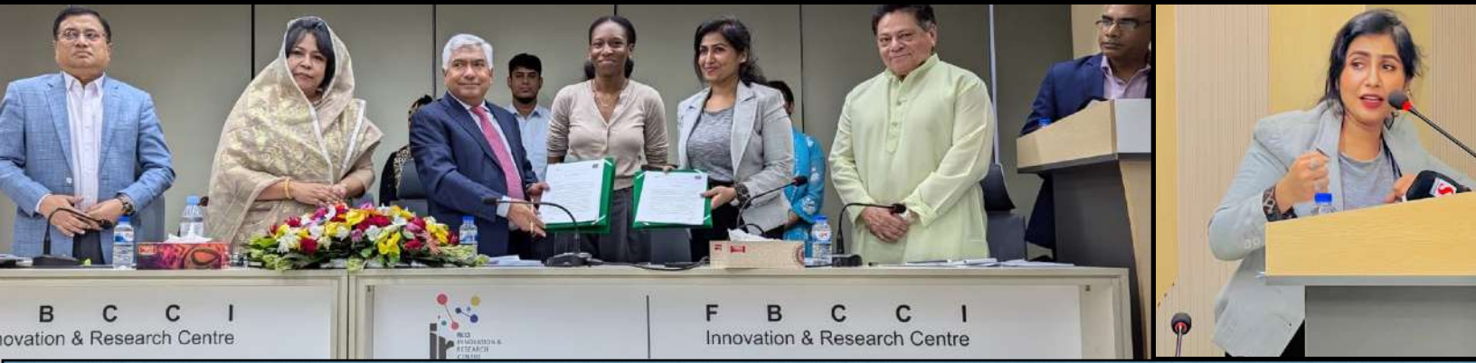
Bangladesh Chamber of Commerce (FBCCI) & HerNet MOU signing, knowledge by British High Commission