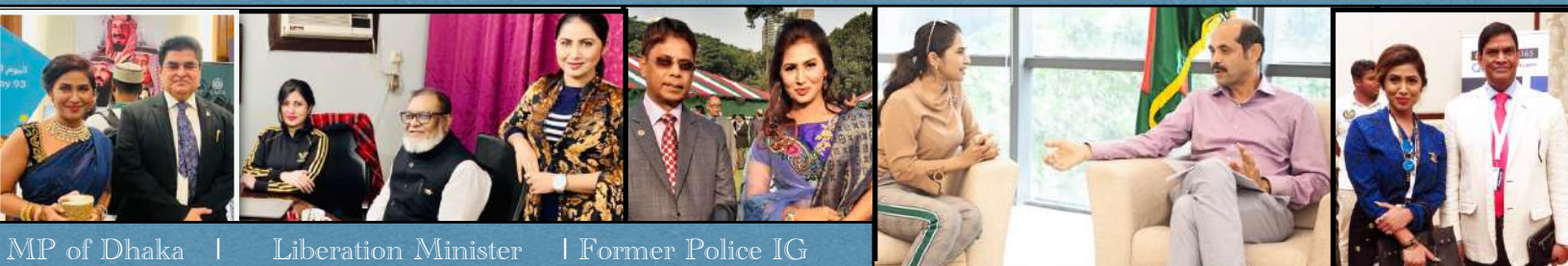
MP of Dhaka | Liberation Minister | Former Police IG