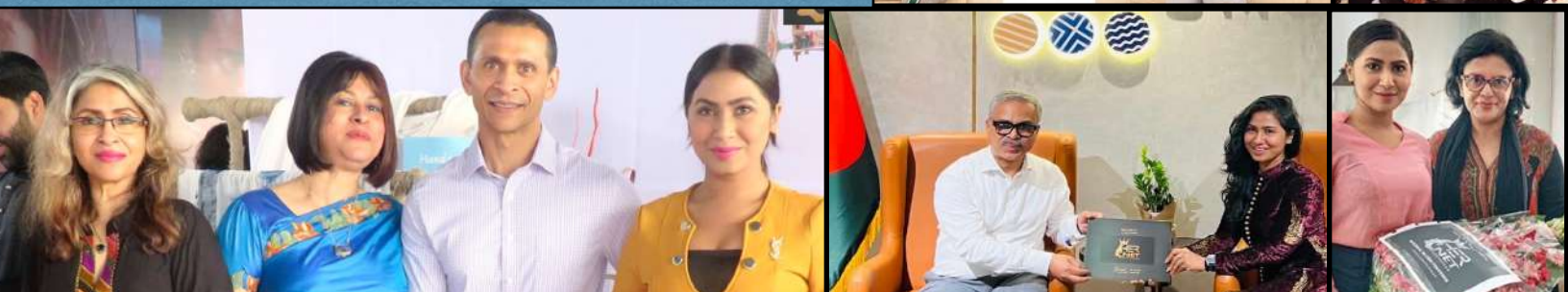
With the children of 1st Prime Minister of Bangladesh |